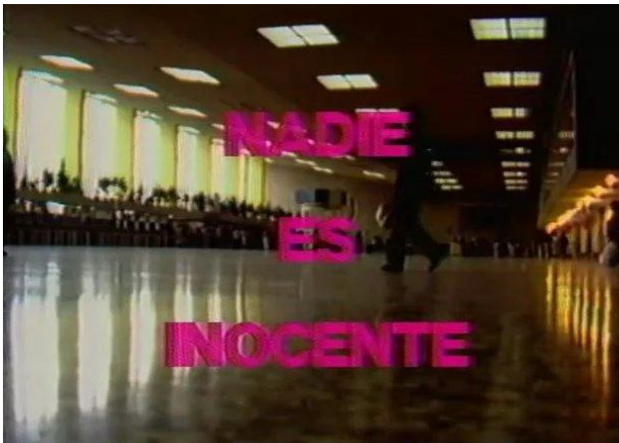
Figure 2.1: Sarah Minter, Nadie es Inocente , 1987 ©artista

In the public sphere, she, along with other individuals, have generated broadcasting projects such as "La sala del deseo" at the Centro de la Imagen. At the start of the 1990s, she organised the country's first video workshops at the Casa del Lago, and at the end of that same decade, she set up, at the "La Esmeralda" school at the Centro Nacional de las Artes (Mexican National Arts Centre), the video workshop where many artists trained who currently are working with this format. Apart from continuing to develop project, she is currently part of a research network to reconstruct the history of Mexican video art (Malvido Ariaga, 1999). Her work has been exhibited inside and outside Mexico. Her work has won prizes at the La Habana International Film Festival and at the Mexican Film Festival. Apart from producing her own works, she has taught at the Universidad Iberoamericana and at the Centro Nacional de las Artes (CENART) in Mexico D.F.. She has been awarded Rockefeller Foundation, MacArthur and FONCA scholarships. In 2003, she spent time in Berlin and in 2006, in Cristiania, The Free Town (Denmark) to work on the Multiverse project about utopian communities around the world (Debroise & Medina, 2006). Video-art, specifically featuring the indigenous and gender, contains radical reading and writing projects. Multi-ethnic, multi-directional, interdisciplinary and non-linear writing is typical.