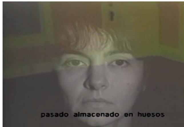
Figure 3.2 Pilar Rodríguez, La idea que Habitamos , 1990©artista

In La idea que habitamos , she reflects on the situation of the Chicanan women who is always stuck at home. Her poems question the loneliness and identity of a woman who is split in two, as a woman and as Chicanan. This is not a narrative or documentary video, purely a poetic one. Ella es frontera is in the same line, even though losing one's roots and displacement are seen through a woman split into two.