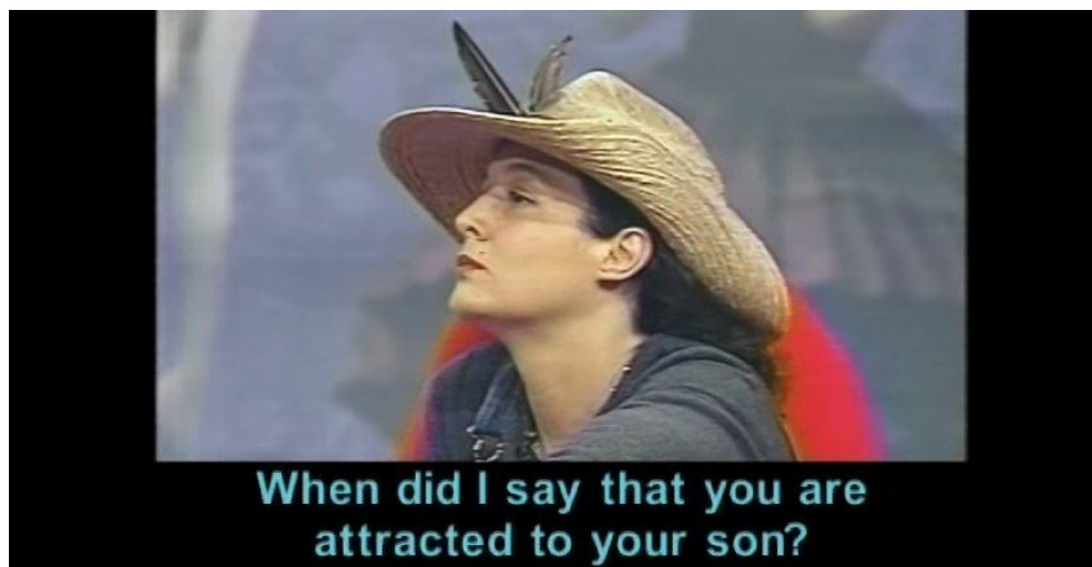
Figure 3.1: Ximena Cuevas, tombola, 2003©artist

The Mexican tradition survived throughout the 20 th century. This tradition provided the setting for the work of Pilar Rodríguez (1962). She investigates the idea of the poetic experience of displacement and the woman-frontier relations. She does not have a very extensive collection which can be referred to as female images. Her most important videos are La idea que habitamos (1990) (Figure 3.1.1) and Ella es frontera (1995). In both works, the Chicanan culture is the key reference, along with the female vision of being Chicanan.