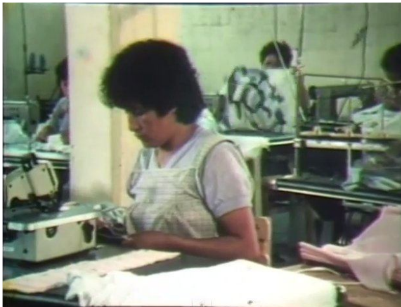
Figure 2.2: Mari Carmen de Lara, No les Pedimos un viaje a la luna, 1985 ©artista

The work of Mari Carmen de Lara (1957), the filmmaker, is in the same vindictive lines using documentary videos. Spirited and focused on feminist issues, she has become the most prolific Mexican documentary makers, with more than thirty short-, medium- and feature length films to her name. Her documentaries directly question the taboos that continue to mark the social history of Mexico: the decriminalisation of abortion, the abuse of women within the family, reproductive health, AIDS, the exploitation of female workers, gender inequality. Opera Femine features fragments of her most typical and censured works, such as No les pedimos un viaje a la luna (1985) (Figure 2.1.1), a film document that covers the social and political consequences of the 1985 earthquake in Mexico, where she highlights the sweatshop conditions of female seamstresses and harshly criticises the figure of the President. The producer also accounts her social and personal concerns as a woman forged in and with the feminist thought of the 1960s, and how she has taken it on board through filmmaking and her social commitment (Noriega & López, 1996).