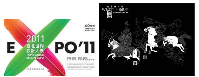
Figure 20: Taipei World Design Expo 2011 Figure 21: Grammy Awards Packaging Design 2007