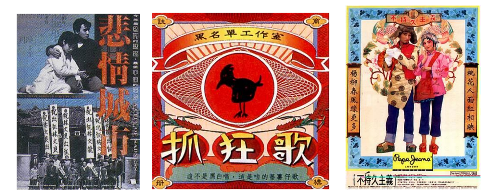
Figure 15: Movie Poster 1989 Figure 16: Record Jacket 1990 Figure 17: Apparel Advertisement 1997

How Taiwanese design would develop in the future in response to the internationalization and informationalization of design was certainly an important issue faced by designers at this phase. In addition, another urgent priority for these designers was finding an orientation for Taiwanese design and creating a unique style. As such, many young Taiwanese designers, who were concerned about its design culture during the 1990's, began to search for Taiwanese impressions, color, culture and spirit through poster design and creation. These designers cleared a path for modern contemporary Taiwanese poster design and opened up a new style with its attention to cultural concerns (Figure 18). During this phase, the rich style of Taiwanese visual design reflected changes in the political environment, in addition to representing a style in which diverse cultures were integrated, and the modern and traditional coexisted. Interests in hand-painting design, and the spirit of Taiwanese culture, both of which were forgotten as a result of the convenience of computer design, were reconsidered as well.