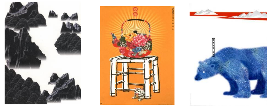
Figure 22: Eastern Cultural Spirit Design 2006 Figure 23: Nostalgic Taiwanese Poster 2006 Figure 24: Ecological Protection Advertisement Design 2009

Figure 20: Taipei World Design Expo 2011 Figure 21: Grammy Awards Packaging Design 2007