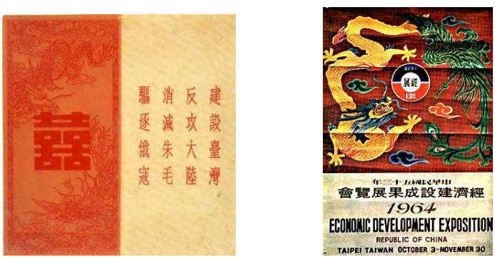
Figure 9: Early Post-War Period Visual Design 1950 Figure 10: Traditional Chinese style Poster 1964