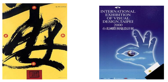
Figure 18: Taiwanese Impression Poster 1918 Figure 19: Taipei International Visual Design Exhibition Poster 2000