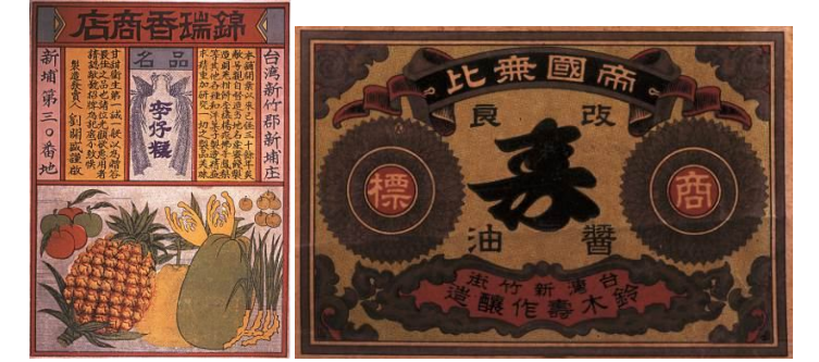
Figure 1: Honey-preserved Foods Label 1930s Figure 2: Soy Sauce Label 1930s