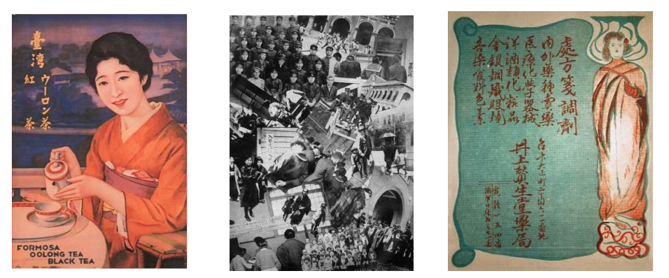
Figure 3: Taiwanese Tea Poster 1918 Figure 4: Collage Style Layout 1932 Figure 5: Art Nouveau Advertisement 1918