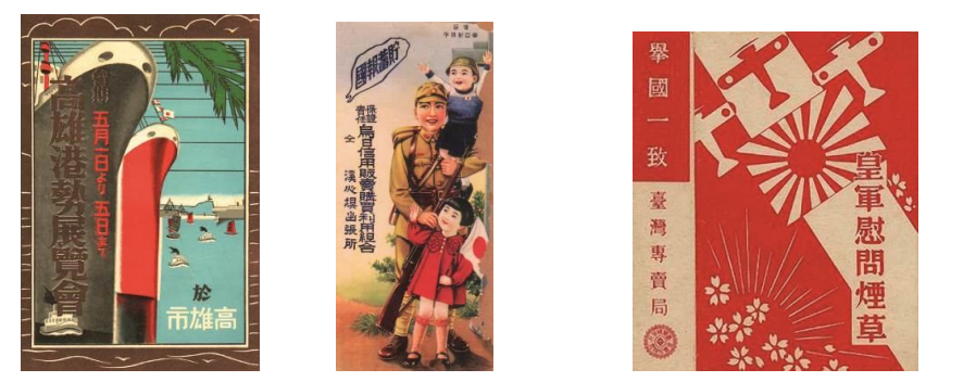
Figure 6: Art Deco Poster 1931 Figure 7: War Time Propaganda 1942 Figure 8: War Time Packaging 1940