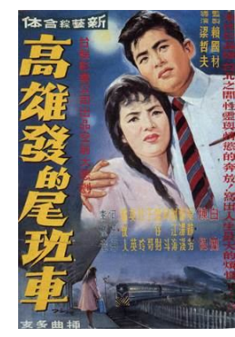
Figure 11: Modern Style Book Cover Design 1932 Figure 12: Hand-painted style Movie Poster 1963