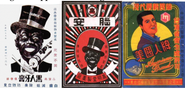
Figure4: Darkie toothpaste 1949 Figure5: Darkie medicine1960sFigure6: American brand medicine1960s