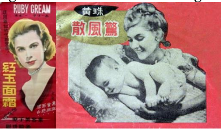
Figure 7: Ruby cream 1960s Figure 8: Children's medicine 1960s