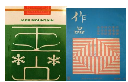
Figure 29: Cigarette package design 1961 Figure 29: Magazine cover design 1969

they usually shaped a clean modern style design. At that time, not only a domestic professional designer response a logo, but foreign designer assisted Taiwan enterprise designing schedule. In 1961, monopoly bureau had hired American designer, Alfred B. Girady, who had coached Taiwan industrial design, to design packages on wine and cigarettes (Figure 29). At that time, Taiwan folk enterprise followed this kind of design as a clean design one after another. In 1960s, under pop style affect, Taiwan appeared this kind of illusion affect style design(Figure 30).