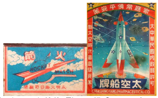
Figure 16: Rock match 1960s Figure 17: Spacecraft medicine 1960s